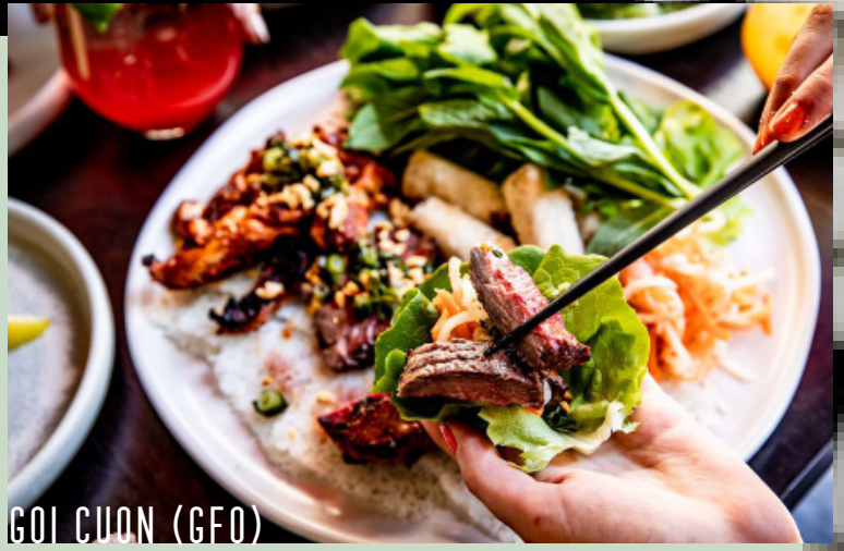
GOI CUON (GEO)