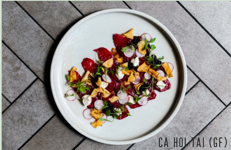
CA HOI TAI (GF)

PLEASE BE AWARE WE USE NUTS AND NUT PRODUCTS AND CANNOT GUARANTEE THAT OUR DISHES WILL NOT CONTAIN ANY NUTS. NO ALTERATIONS TO THE MENU. PRICES ARE SUBJECT TO CHANGE WITHOUT NOTICE. CREDIT AND DEBIT CARDS INCUR A SURCHARGE AT OUR LOWEST COST OF ACCEPTANCE. 10% SERVICE FEE IS ADDED ON PUBLIC HOLIDAYS AND GROUPS OF 8 OR MORE. CAKEAGE FEE $4 PER PERSON.