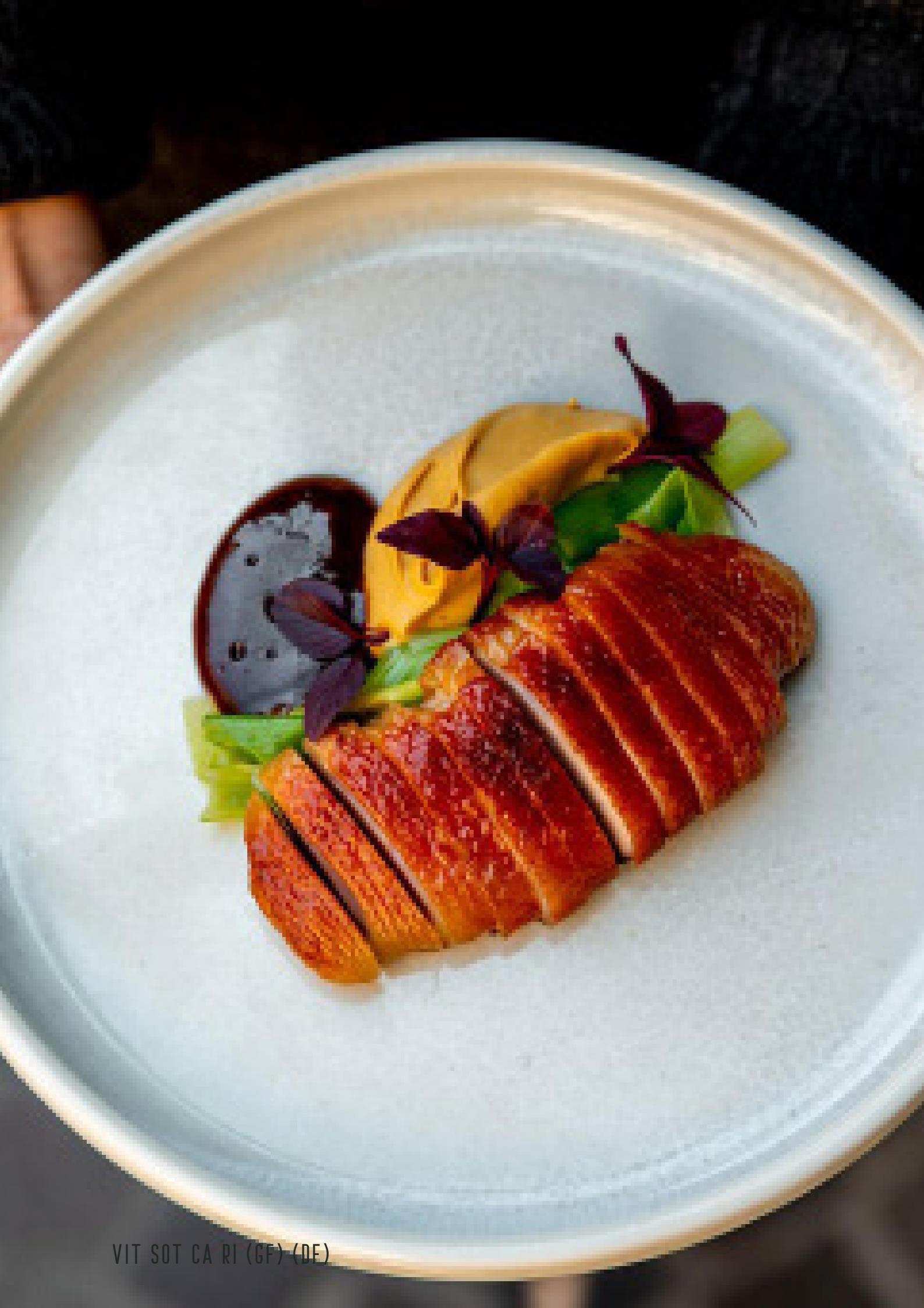
VIT SOT CA RI (GF) (DE)